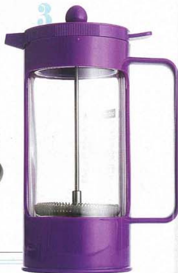
EVERY KITCHEN NEEDS